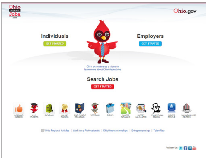
OhioMeansJobs.com home page

If you owe child support and are unemployed, a new state law requires you to register with OhioMeansJobs.com . This is the free online career and employment center the Ohio Department of Job and Family Services operates in partnership with Monster.com . It can make your job search faster, easier and more successful.